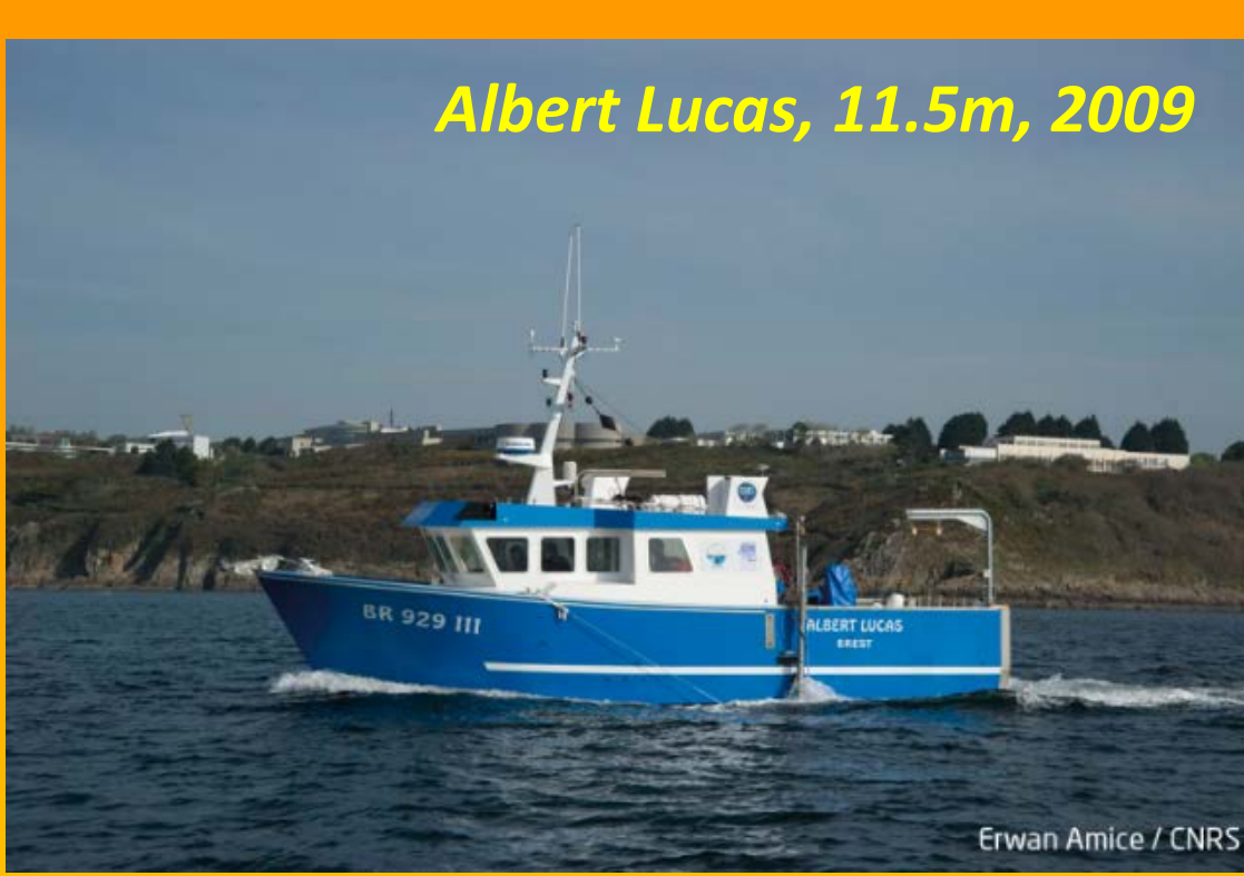
R/V Albert Lucas