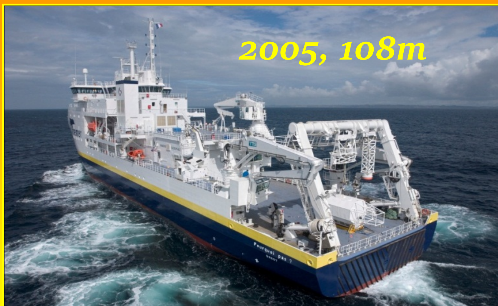
R/V Pourquoi Pas ?