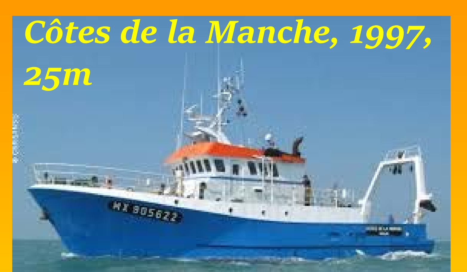
R/V Côtes de la Manche