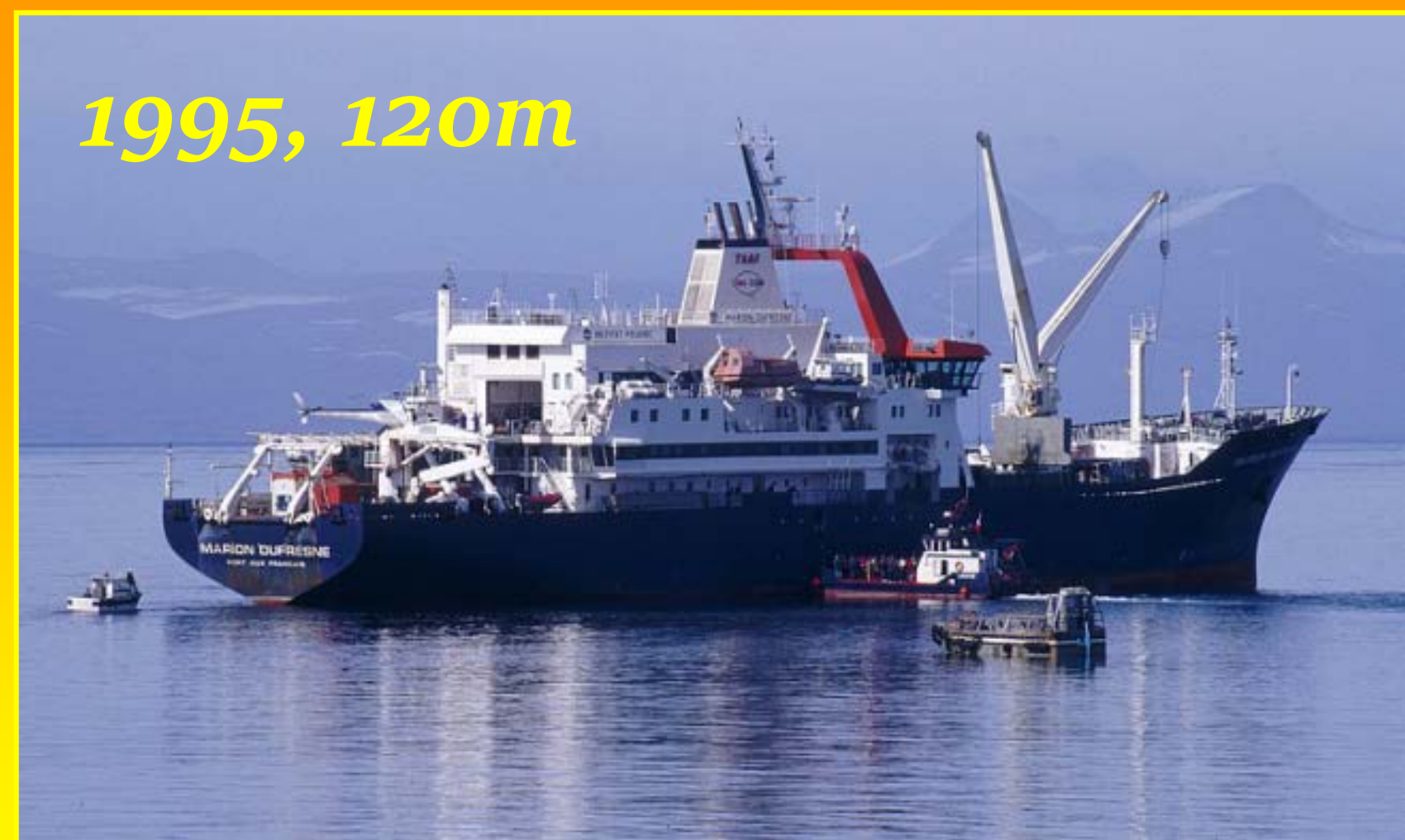
R/V Marion Dufresne